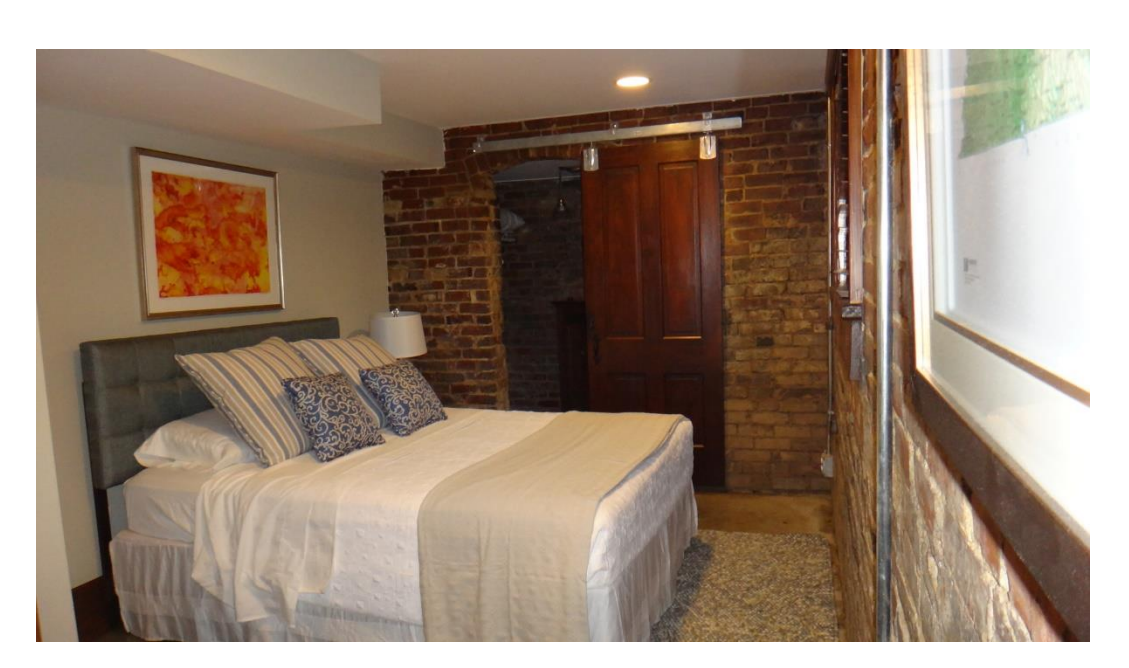
VIEW OF BEDROOM 2