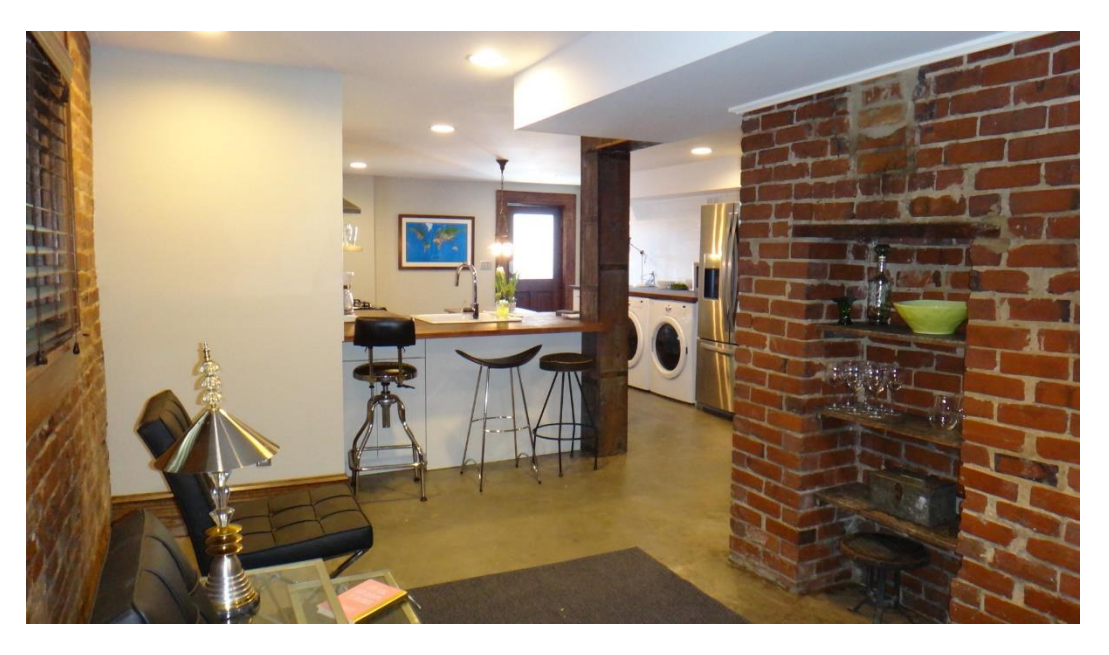
VIEW OF LIVING ROOM