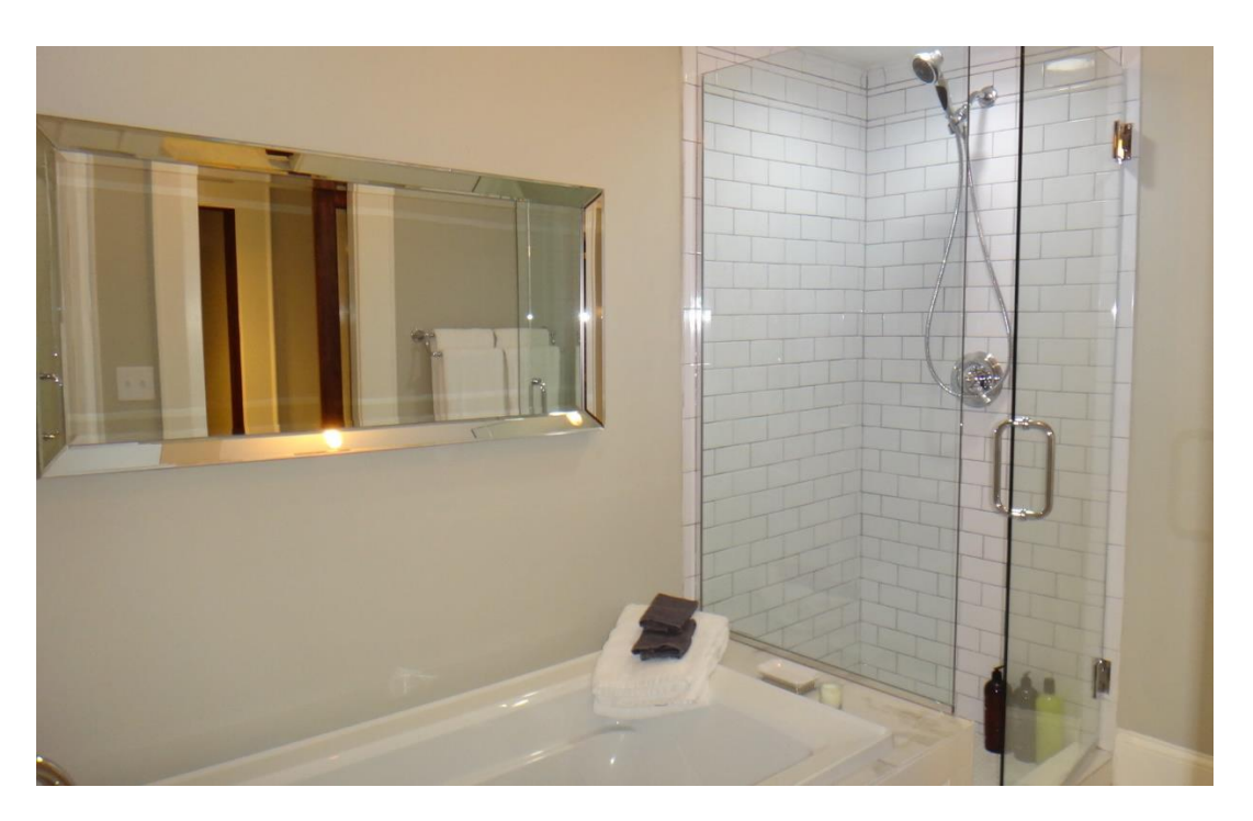
VIEW OF BATHTUB AND SHOWER

(NOTE: EACH BEDROOM HAS A SEPARATE AND PRIVATE TOILET AND SINK ADJOINING THE BATHING ROOM)