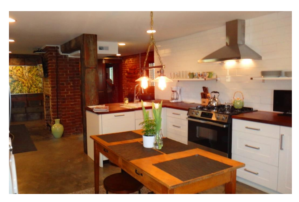
VIEW OF KITCHEN WITH LIVING ROOM BEYOND