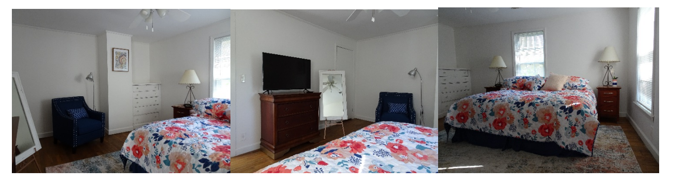
Bedroom 2: King bed