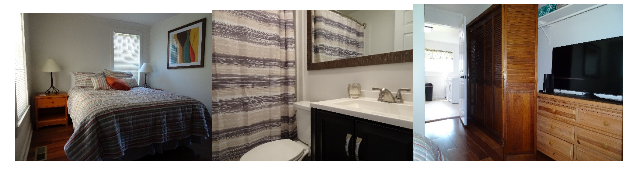
Bedroom 1 : Downstairs, queen bed and full bath. Large closet.