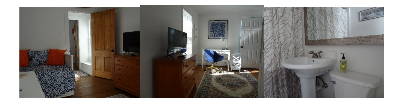
Bedroom 3 : Day bed that pulls out to make king bed. Desk. Full bath.

Pet deposit $250.00. Smoking inside is not allowed. Parties not permitted.