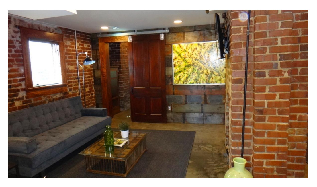
VIEW OF LIVING ROOM