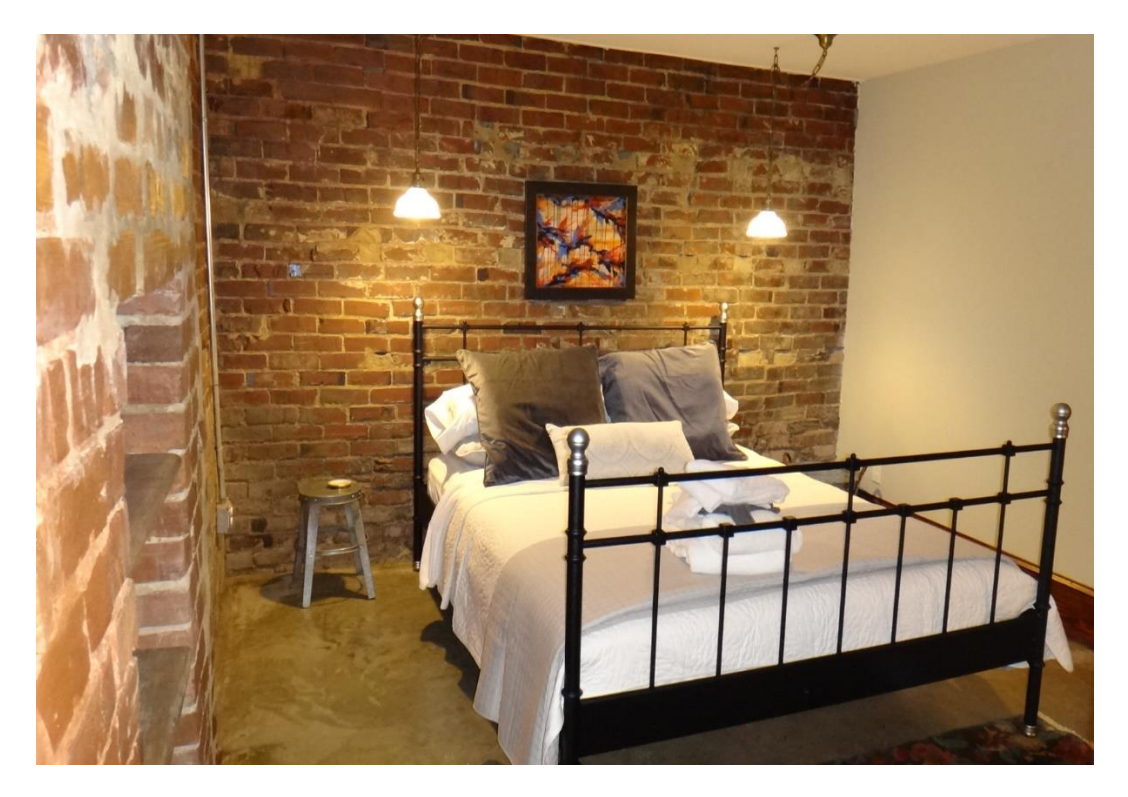
VIEW OF BEDROOM 1