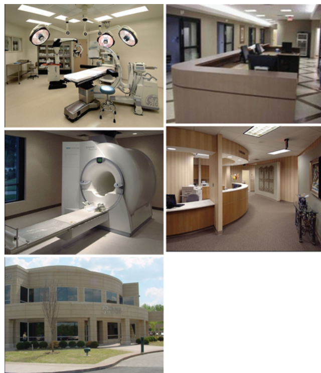
FIG. 5. Photographs of the modern Semmes-Murphey Clinic.