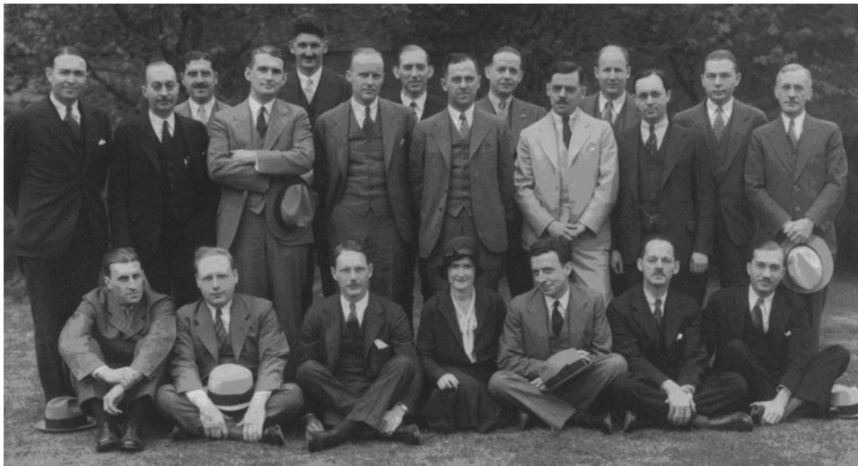
FIG. 3. The first meeting of the Harvey Cushing Society, May 6, 1932. Reprinted with permission of the AANS.