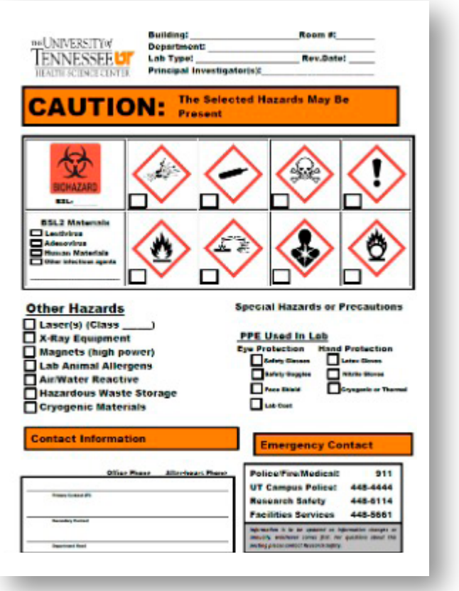
FIGURE 1: Laboratory Workplace Hazard Assessment

Laboratory Supervisors are encouraged to consult with the Office of Research Safety Affairs when assessing procedures that may be deemed as highly hazardous. When completed by the Laboratory Supervisor or a representative from the Office of Research Safety the following form meets the criteria for a workplace hazard assessment. It may be obtained from the Office of Research Safety.